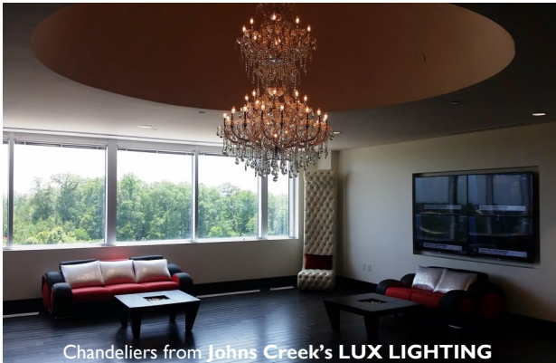
Chandeliers from Johns Creek's LUX LIGHTING

Ebix began moving into their GLOBAL HEADQUARTERS in JOHNS CREEK on Monday, June 1st!!! This global headquarters has every aspect centered around their employees!